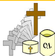
Sacrament of Anointing