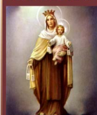
OF MT. CARMEL

Please join us as we Celebrate the Eucharist in honor of The Feast of Our Lady of Mount Carmel